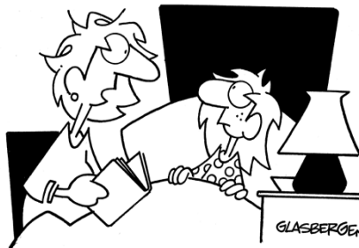
"Yes, the disciples followed Jesus... but not on Twitter."