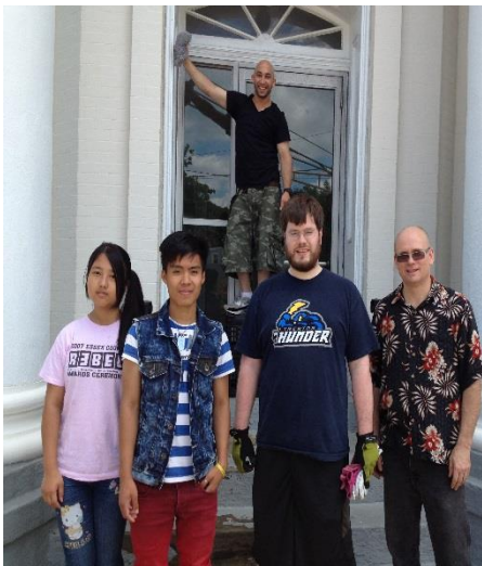
'A few workers got together on June 14th for an outside cleanup'

the street, and the list goes on. God is calling us to make a difference everywhere we go. In fact, this is what Jesus was suggesting in Matthew 28:19-20 when He gave us the Great Commission when He told us to go and make disciples of the nation's baptizing them in the name of the Father, Son, and Holy Spirit and teach them to obey the things that He commands us to do. He was telling us to go and make a difference in somebody's life by sharing His love and by telling them about Him who still lives and still saves. On this day go out and be an agent of change and make a difference in someone's life. Be a walking sanctuary and make a sanctuary everywhere you go. If you take the presence of God that resides in you and share it with those that you meet, God will use you to make a difference in their life.